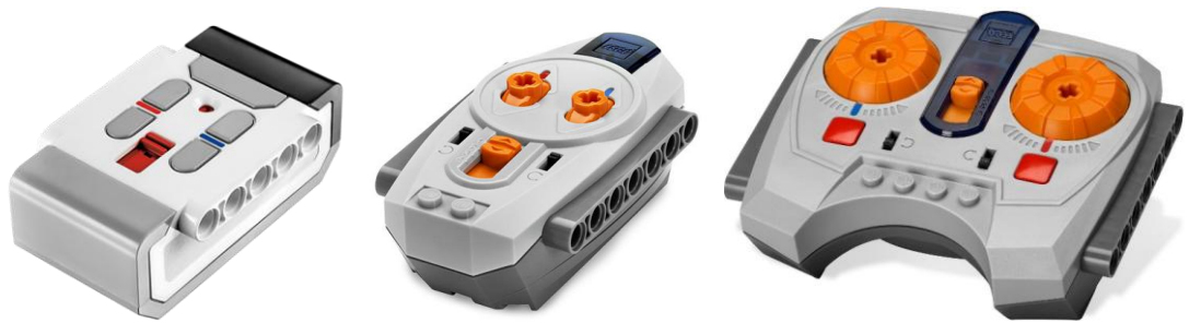
Figure 2 «Examples of IR-remote control devices»