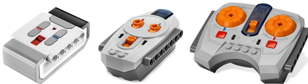
Figure 2 «Examples of IR-remote control devices»