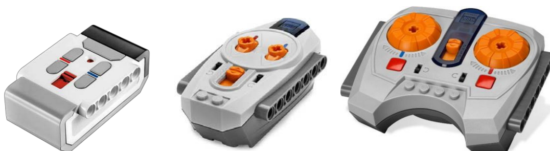
Figure 2 Examples of common IR remote controls